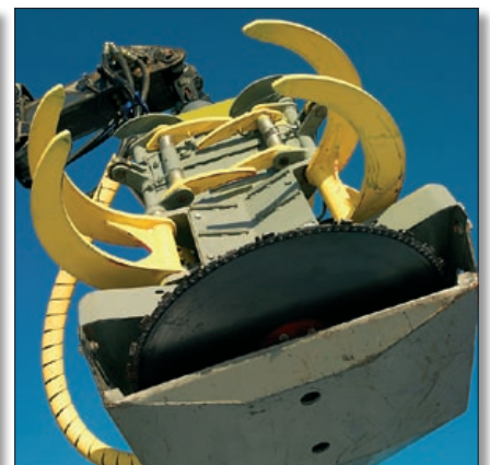
The patented cutting solution makes the C16.a extremely effective.

Bracke reserves the right to make changes without prior notice.