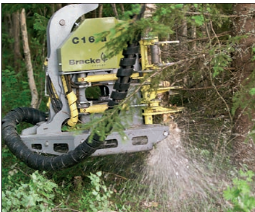
The C16.a cuts and gathers effectively.