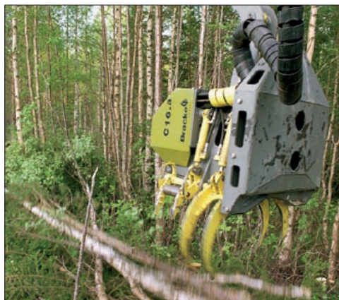
In its tilted position, the C16.a can be used as a grapple for loading and unloading.